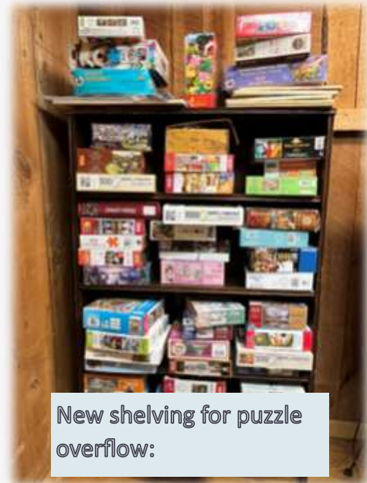
New shelving for puzzle overflow:

All these numbers mean that I have counted and applied the WLPOA property stamp to all donated items, shelved the new pieces, and reshelved the returned books and media. During the last year, it has taken me 75 visits to the library (often twice a week as needed) to shelve returned books and process donated books, as well as returned and donated puzzles, games, audio books, and movies. Many of these materials serve children of all ages, as well as adults, and the children's room has been more heavily used this year than ever -- a very satisfying turn of events for the librarian!